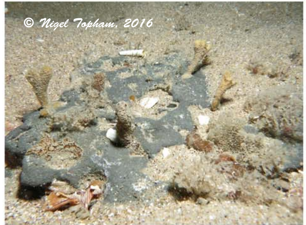
Railway Line Wreck Reef Small branching sponges on smooth bedrock.