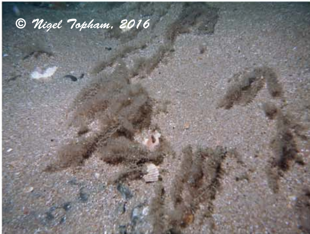
Railway Line Wreck Reef The scour tolerant bryozoan Vescicularia spinosa (Lamb's Tails) on bedrock virtually buried in mobile sand