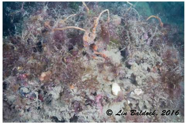
Perry Ledge Outer Reef Silty boulder with a range of sponges and mixed seaweeds.