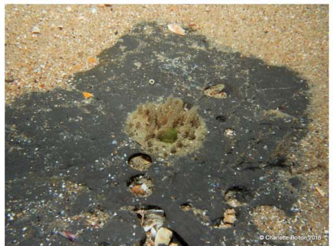
Railway Line Wreck Reef A small sponge colony before and after wafting of overlying layer of clean mobile sand showing smooth bedrock beneath