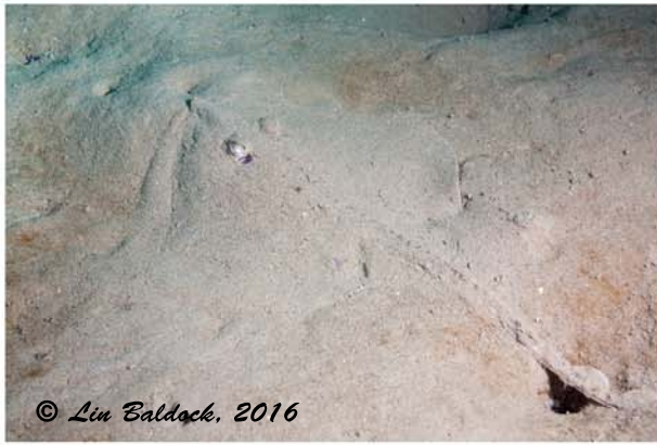
Perry Ledge Outer Reef A juvenile Spotted Ray the size of a saucer hiding in the soft muddy sediment at the base of the reef in about 15m. There was a lot going on in the mud: lots of worms, burrowing brittlestars and the burrowing anemones Edwardsia claparedii and Peachia hastata