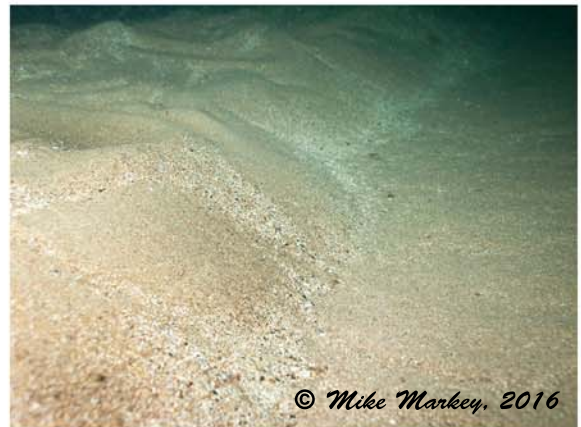
Railway Line Wreck Reef Rippled medium sand washed into mega-ripples up to 1.5m high