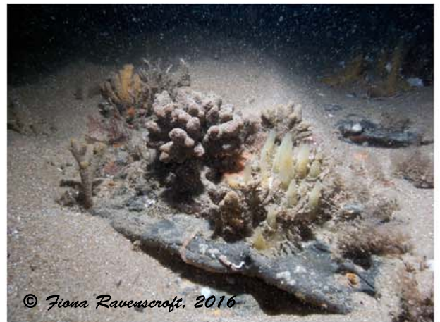
Railway Line Wreck Reef Branching and cushion sponges crowded onto smooth bedrock.