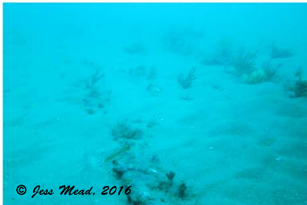
Railway Line Wreck Reef Very low bedrock ledges supporting a variety of branching and cushion sponges, almost inundated by clean, mobile, medium sand.