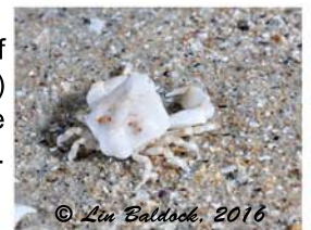
Railway Line Wreck Reef Nut crab ( Ebalia sp) about the size of a 50p piece crawling around on the sand.