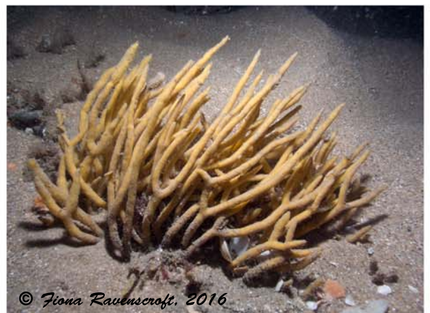
Railway Line Wreck Reef A substantial colony of the nationally scarce sponge Adreus fascicularis on bedrock buried in clean, mobile sand.