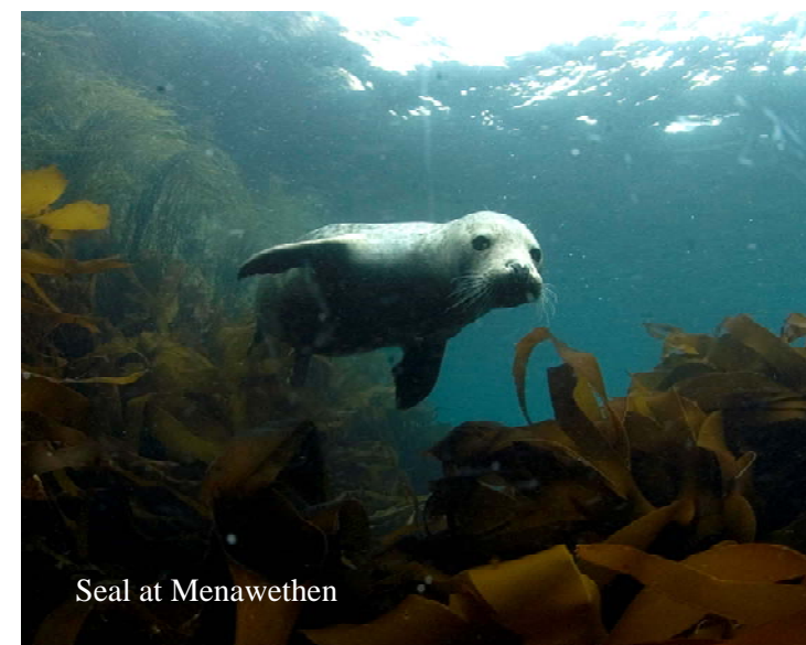
Seal at Menawethen