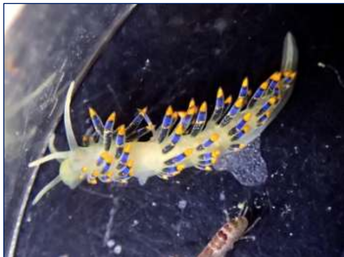
Cuthona caerulea from Gubby's Reef