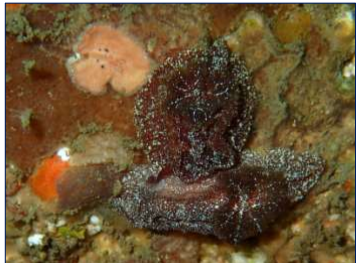
Goniodoris castanea nudibranchs mating at Burnmouth Caves, with a flatworm top left

On the way back we took advantage of the excellent conditions to have a third dive at Burnmouth Caves, a site which can only be explored on the calmest days. Some divers entered the caves, while others were so captivated by the abundant life on the wall outside that they didn't even get around to the caves!