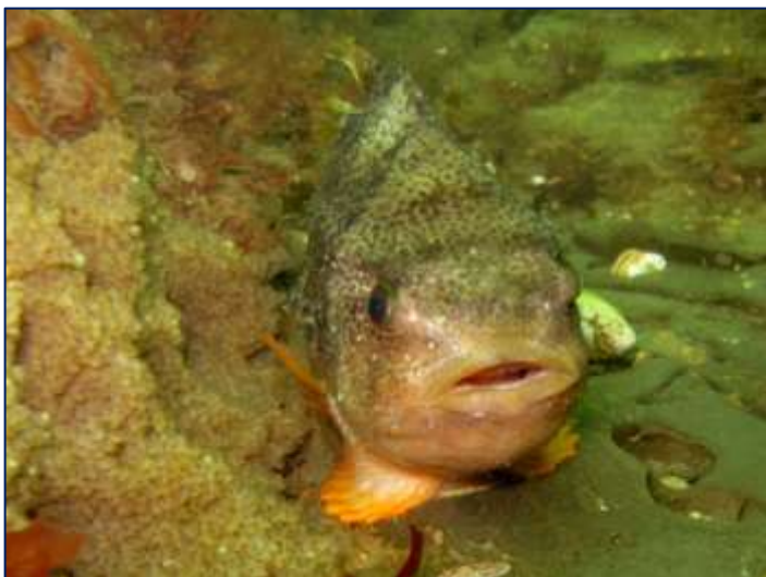
Lumpsucker guarding eggs at Runswick Bay rMCZ

Dives marked NT are part of the National Trust's programme of coastal bioblitzes to celebrate the 50 th anniversary of Enterprise Neptune.