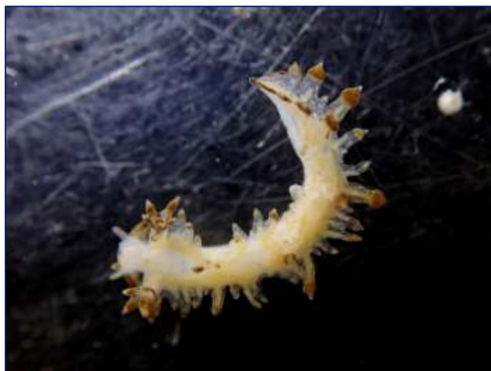
Lomanotus marmoratus from Gubby's Reef