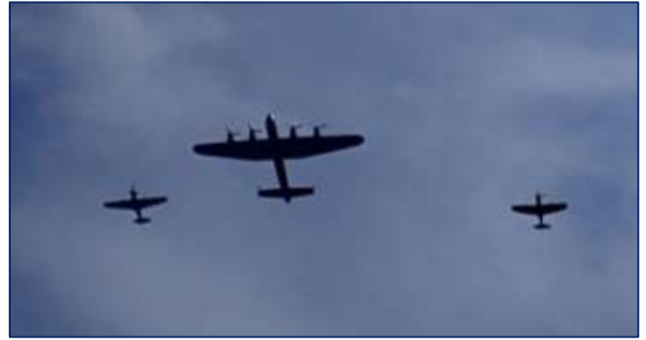
Lancaster, Spitfire and Hurricane from the Sunderland Air Show

As a wonderful finale to the July dives, we enjoyed watching the Sunderland Air Show as we travelled back up the coast – the highlight was when a Lancaster, a Spitfire and a Hurricane flew right over the dive boat!