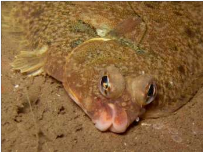
Lemon sole on a reef in the rMCZ

We recorded over 130 species during our dives in the Coquet to St Mary's rMCZ in 2014. We welcome the news that this site has been included in the consultation for designation under Tranche 2 of the MCZ process.