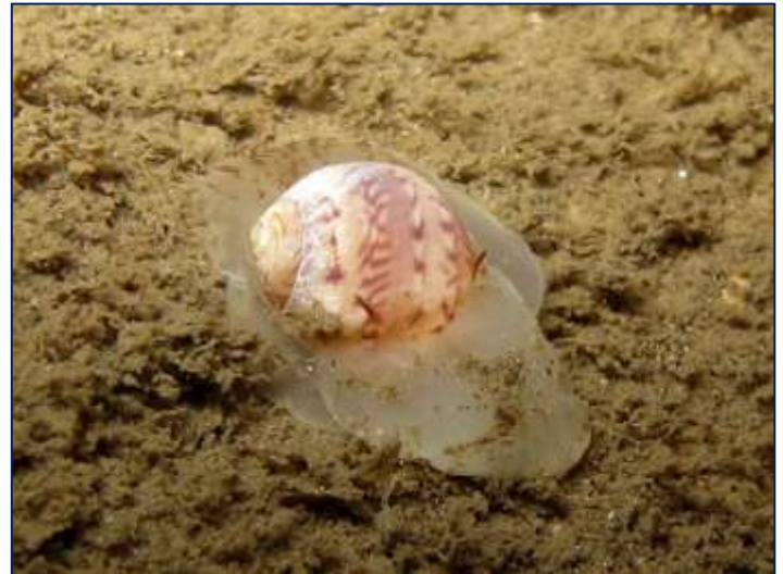
Necklace shell on a reef in the rMCZ

For more information please see our 2012 report and 2014 update on survey dives in the Coquet to St Mary's Island rMCZ.