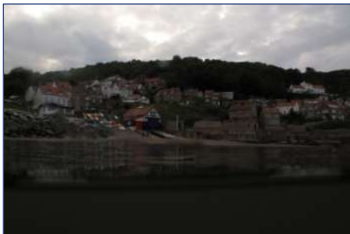
The entry point for shore dives at Runswick Bay

We carried out one shore dive in the Runswick Bay rMCZ in June, further details are available in a brief summary report . We are delighted that Runswick Bay rMCZ was included in the consultation for designation under Tranche 2 of the MCZ process, and especially pleased that it is now being considered for designation for its intertidal as well as its subtidal features, as recommended in our 2012 report .