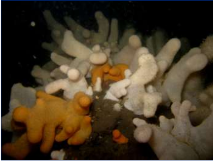
Reef covered in dead men's fingers near Blyth in the Coquet to St Mary's rMCZ

We carried out dives at nine sites within the Coquet to St Mary's recommended Marine Conservation Zone. Two days of diving were subsidised by the North Sea Wildlife Trusts. The sites surveyed were all in the southern half of the rMCZ between Newbiggin-by-the-Sea and Seaton Sluice, ranging from shallow kelp habitats to deeper reefs and wrecks dominated by faunal turf.