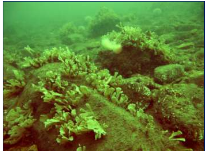
Hornwrack-covered reef on the Durham Heritage Coast

Photos from the dives were displayed at the Durham Heritage Coast Partnership Annual Forum. You can see some of these photos here . We are very grateful to the Durham Heritage Coast Partnership for the funding to continue these surveys.