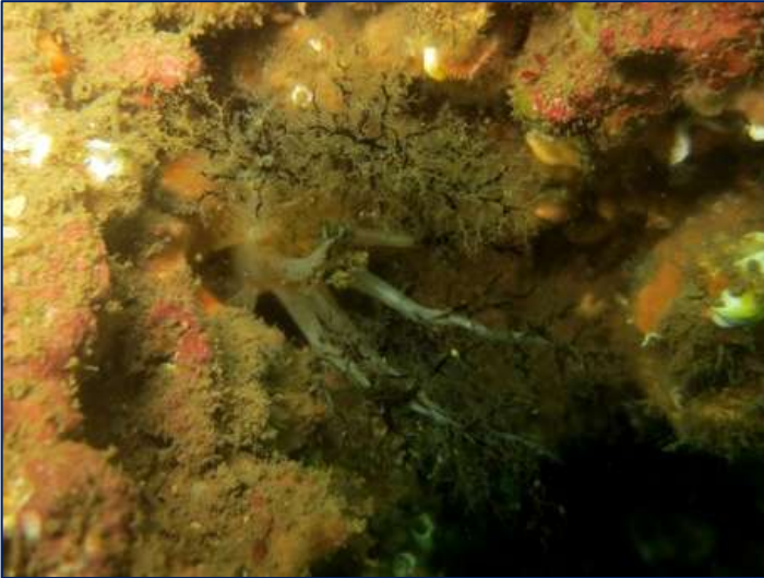
Pawsonia saxicola near Marshall Meadows Bay

We had two fantastic dives on the north Northumberland coast. The first site was close to Marshall Meadows Bay where we carried out Seasearch dives in 2013. We found some new and interesting species on this year's dive, including the crevice sea cucumber Pawsonia saxicola , which previously had only one east coast record (from 1987) on the NBN Gateway, and to our surprise another Marthasterias glacialis spiny starfish!