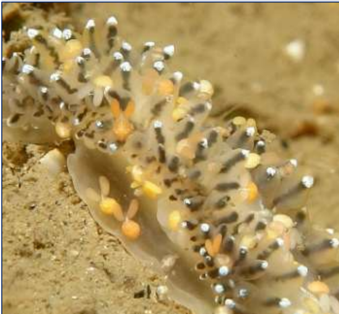
Crystal sea slug infested with the copepod parasite Doridicola agilis

As a wonderful finale to the July dives, we enjoyed watching the Sunderland Air Show as we travelled back up the coast – the highlight was when a Lancaster, a Spitfire and a Hurricane flew right over the dive boat!