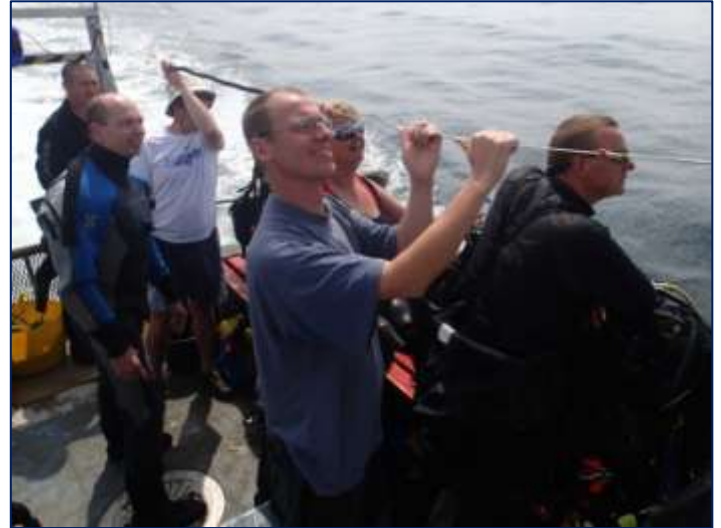
Happy divers watching the Sunderland Air Show from the dive boat Spellbinder II

We recorded over 150 species on the Durham Heritage Coast in 2014. Our dives continue to show the amazing recovery that is taking place since the dumping of colliery spoil at sea ended some 20 years ago.