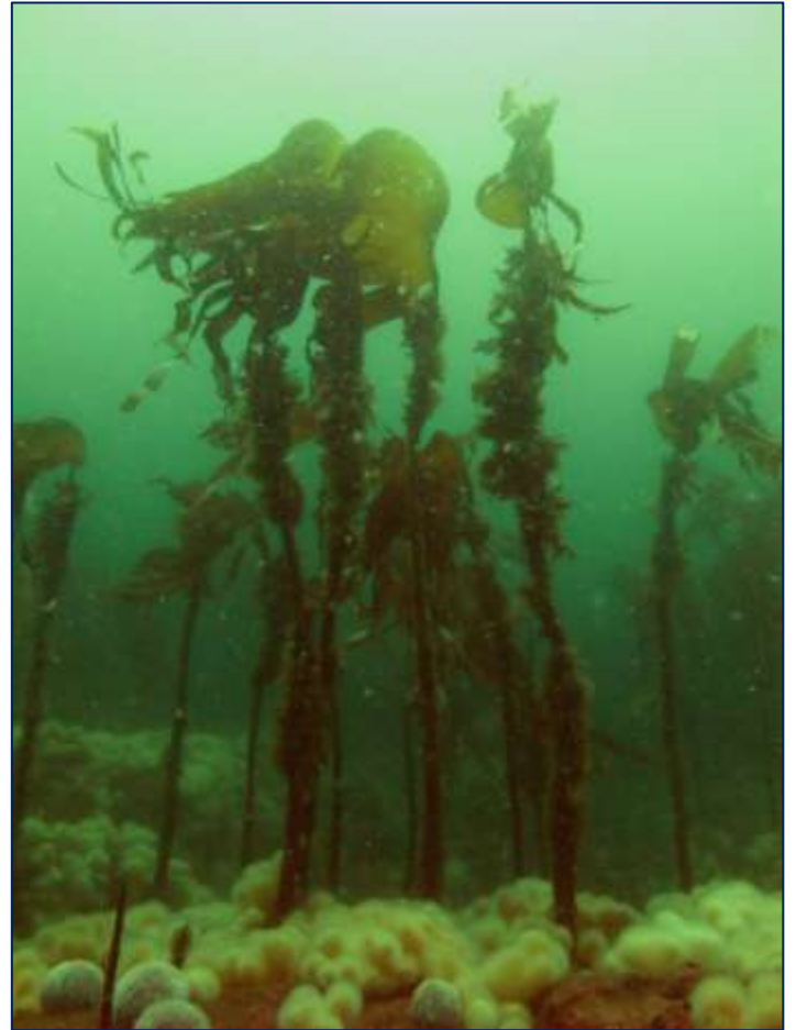
Kelp park at 17m depth at Spittal Hearst

On the way back we took advantage of the excellent conditions to have a third dive at Burnmouth Caves, a site which can only be explored on the calmest days. Some divers entered the caves, while others were so captivated by the abundant life on the wall outside that they didn't even get around to the caves!