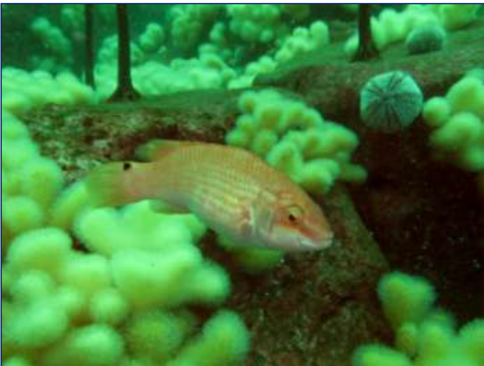
Inquisitive goldsinny at Spittal Hearst

The second site was a well-known angling mark, Spittal Hearst, a pinnacle with its peak at 17m depth. The site was very rich in fish life, including cuckoo wrasse, ling, goldsinny, saithe, pollock and ballan wrasse which were not used to seeing divers and were therefore very curious (or territorial)!