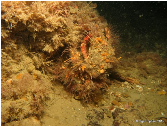
BELOW LEFT: A well-disguised Maja squinado – decorated with red weed and sponges to blend in with the reef.