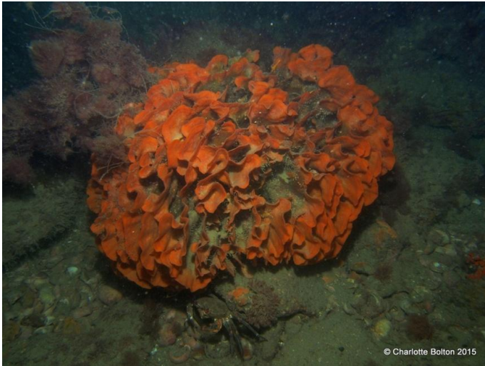
LEFT: Pentapora foliacea (potato crisp bryozoan) is a less common species in Poole Bay than further west in Dorset, especially when of this size (30-40cm across). Unfortunately this specimen was fouled with a tangle of monofilament fishing line with epiphytic red algae (top left of colony).