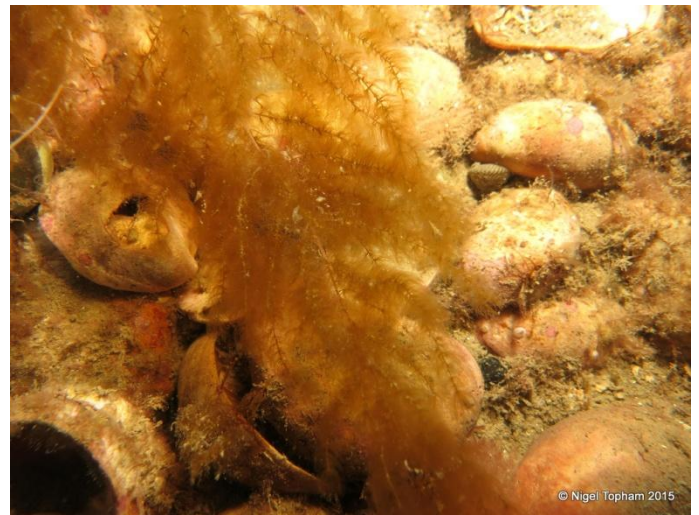
ABOVE: The non-native tunicate Styela clava (leathery sea squirt) is now regularly recorded across Dorset. It is not always as visible as in this instance, generally sporting a thick covering of other squirts, hydroids etc.