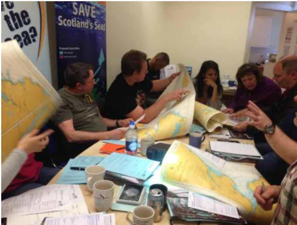
Figure 2 Getting to grips with Admiralty charts (Edinburgh Observer course)