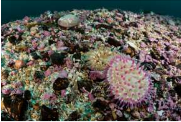
Rich maerl bed at the Hurdles, Orkney