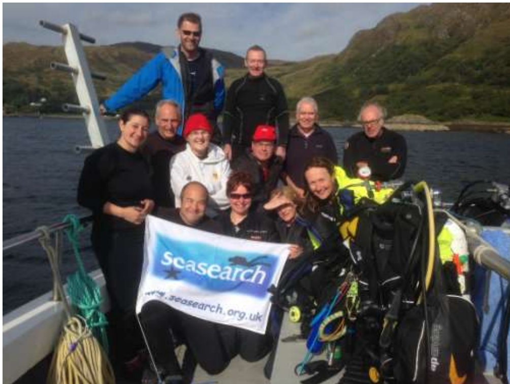
Figure 8 Loch Sunart dive expedition