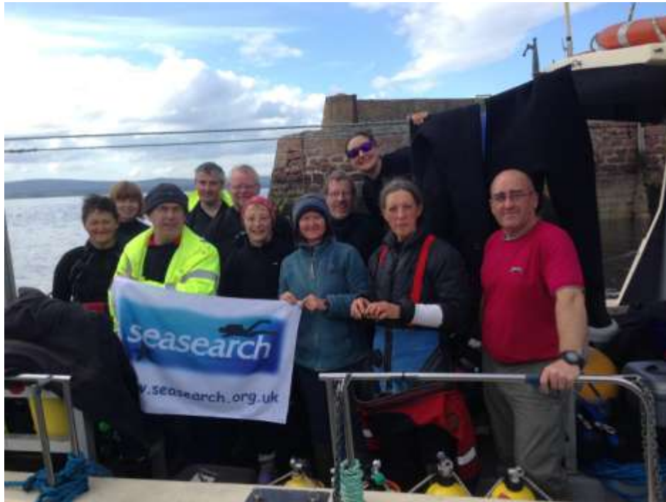
Figure 7 Moray Firth dive trip

http://www.nudibranch.org/Scottish%20Nudibranchs/index.html .