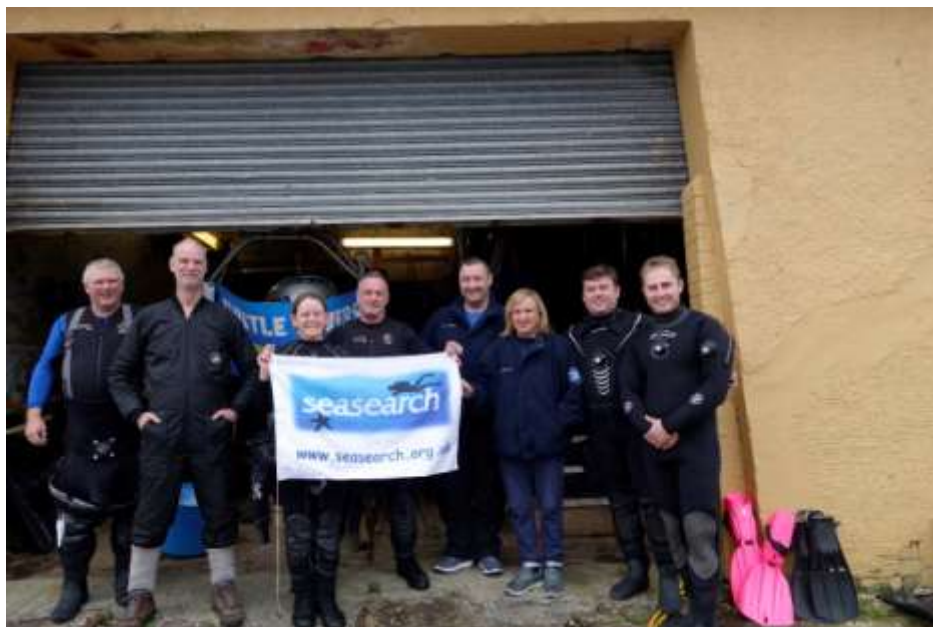
Figure 1 Gourock Observer course

Four Observer courses were held during 2015 in Edinburgh, Aberdeen, Gourock and Broadford with 30 participants. The following day after each course two training dives were held at a nearby location for participants to practice their skills with a tutor on hand. In total eight training dives were held with 29 participants (Table 1). One Specialist nudibranch course was independently organised by members of Guildford SAC on 8 th August, with diving on 9 th August in St Abbs. The course tutor was Scotland's nudibranch expert, Jim Anderson, and there were 12 participants on each day.