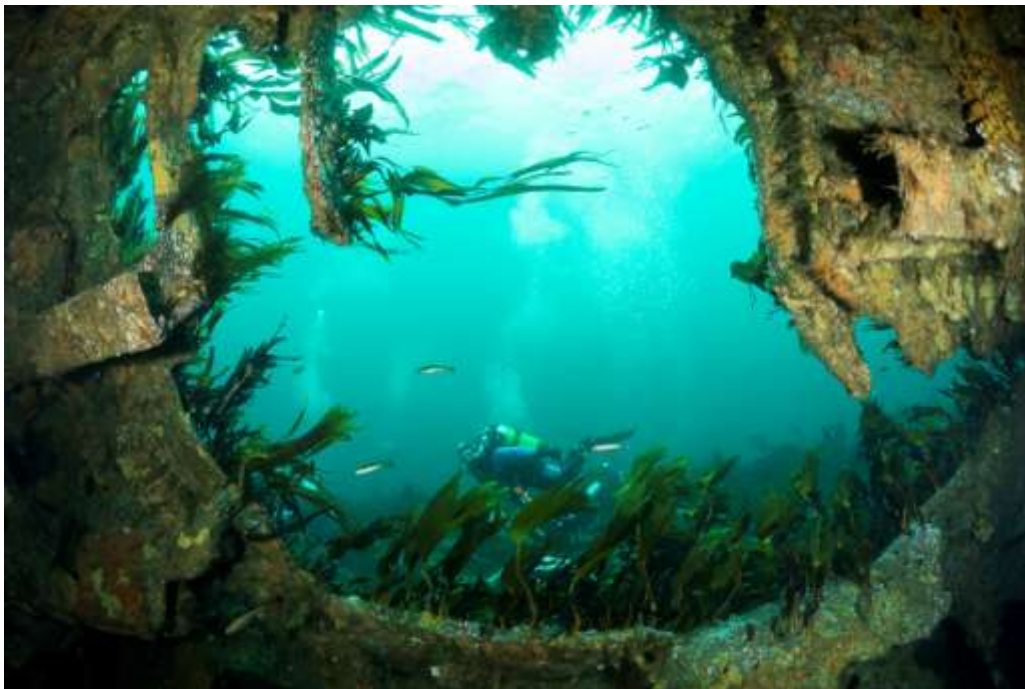
Figure 3 Wreck of the Tabarka with diver Penny Martin enjoying the great visibility

Targeted dive trips organised by Seasearch included South Skye, Arran, Moray Firth, Crinan, Loch Sunart and Scapa Flow, Orkney.