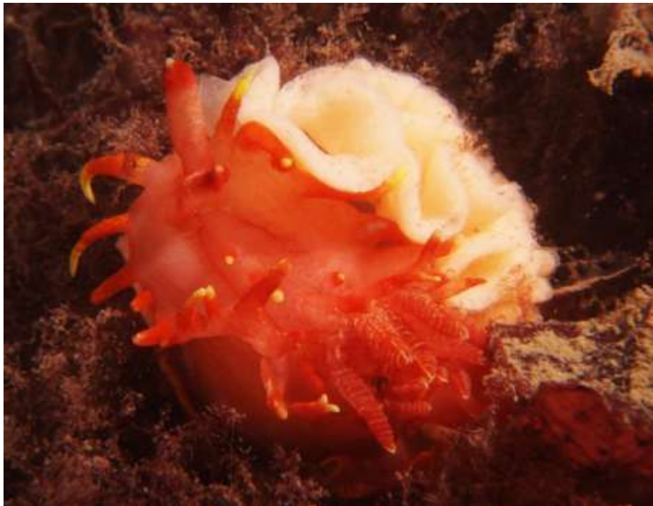
Figure 6 The nudibranch, Okenia elegans