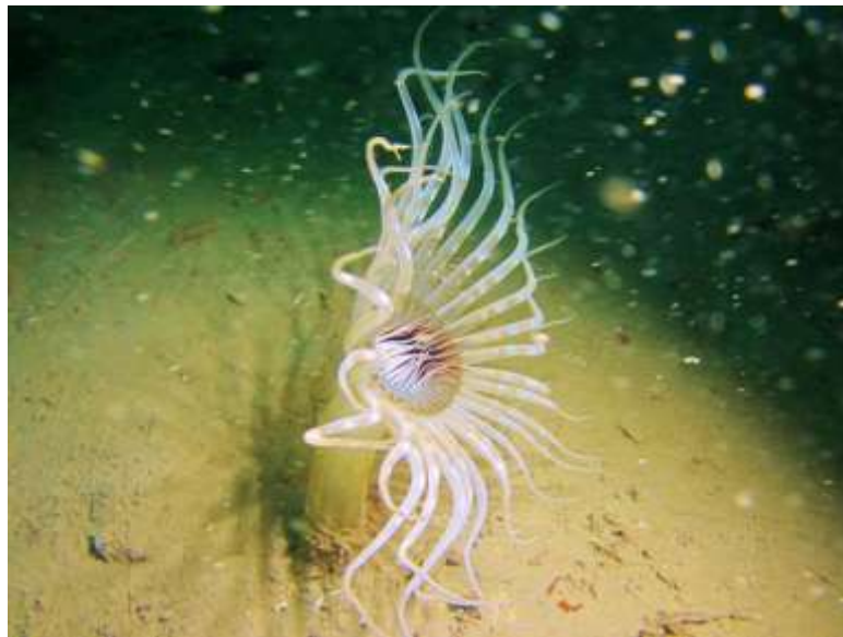
Figure 4 A sighting of the rare, sediment dwelling, anemone Arachnanthus sarsi , near Ardnoe Point at the mouth of Loch Crinan

Priority species Northern Sea Fan, Swiftia pallida , was recorded at all four sites. At Ardnoe Point Slender Sea Pens, Virgularia mirabilis were abundant at one of the sites and White Cluster Anemones, Parazoanthus anguicomus were also recorded. Arachnanthus sarsi was not seen on this occasion but in exactly the same location as the previous record we instead found a single Fireworks Anemone, Pachycerianthus multiplicatus . This priority species is much more common in the inner sea lochs and this was the first Seasearch record from the Sound of Jura. Photographs were taken of both specimens and it is clear that they are different species despite occurring in the same area. Another nationally scarce nudibranch, Okenia elegans , was seen by a number of the divers.