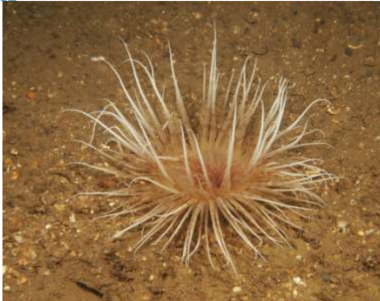
Figure 5 A single fireworks anemone recorded at the same site Pachycerianthus multiplicatus