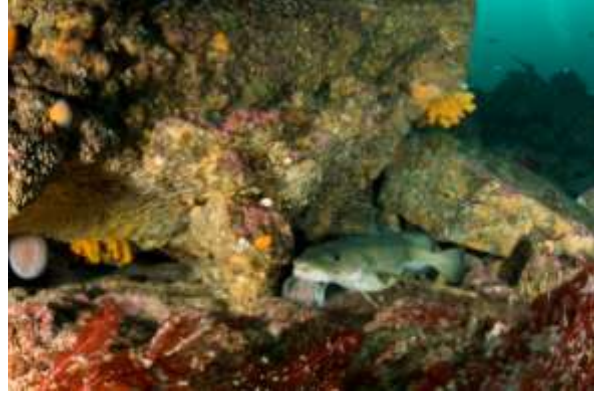
Ling shelters in a crevice at Nipple Rock