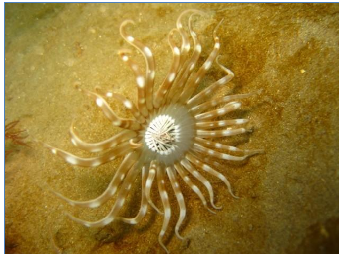
of Arachnanthus sarsi.