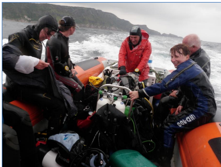
Divers returning to Ballycastle following dives at Bengore Head and the Giants Causeway.