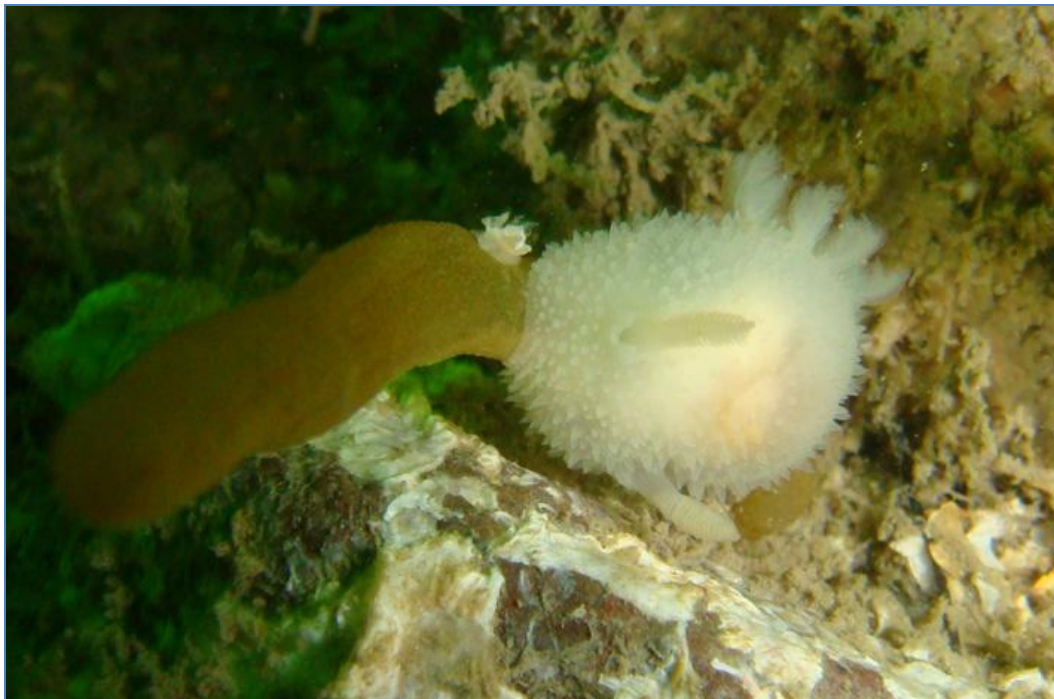
Acanthodoris pilosa, Carlingford Lough.