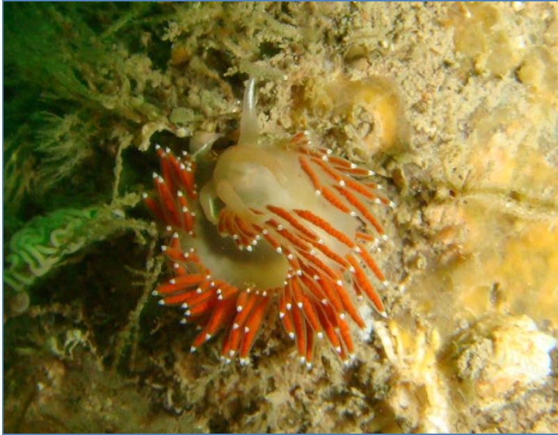
Coryphella gracilis, Carlingford Lough.