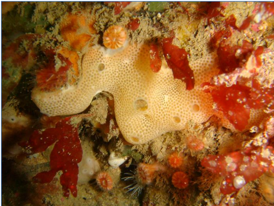
Vidal Rock, Carlingford Lough.