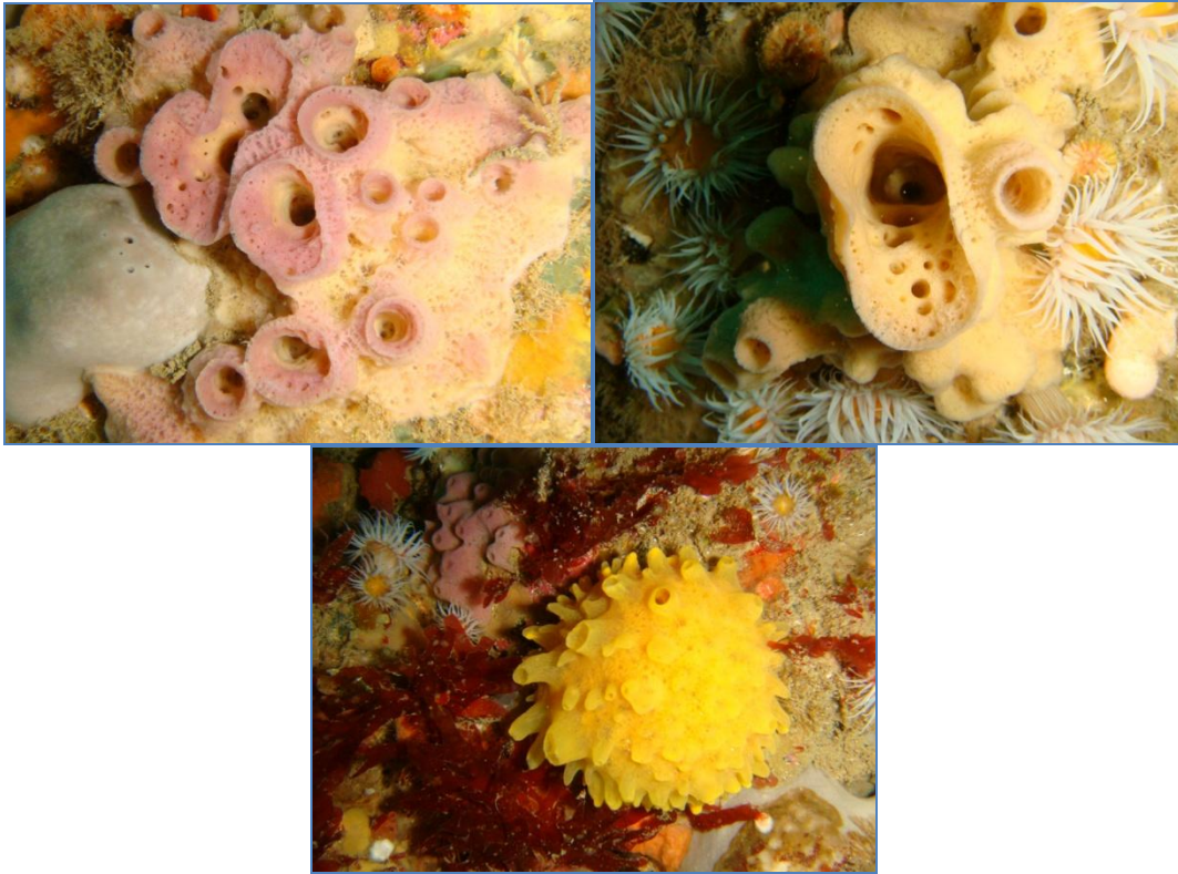
Sponges from North Wall Rathlin (D. Greer).