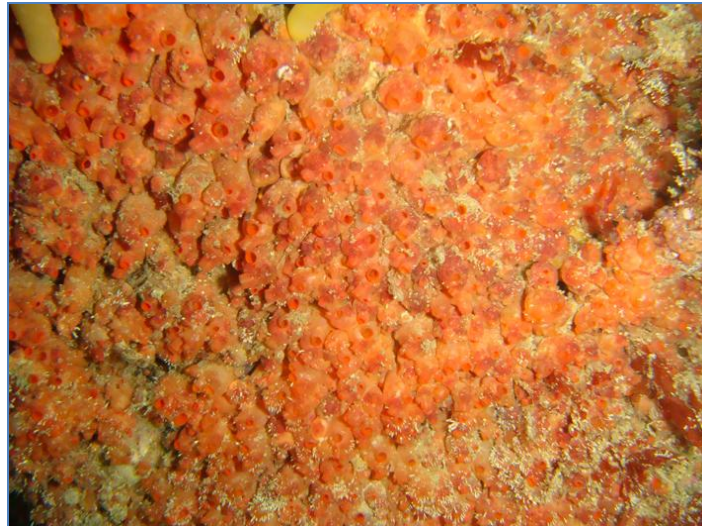
Image of Dendrodoa grossularia from the Giants Causway.