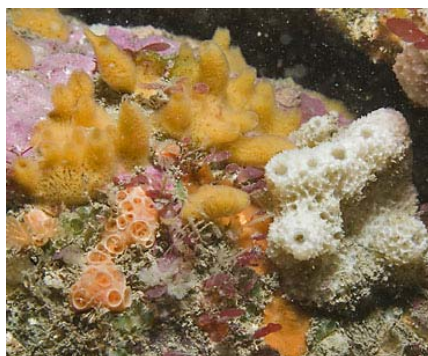
Different sponges at Pen-Las