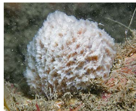
The nationally scarce sponge Tethyspira spinosa