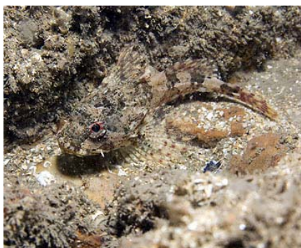
A long-spined sea scorpion

Rock outcrop surrounded by bedrock reef with gullies and short walls. Kelp and mixed seaweeds present in the shallows and mixed and dense faunal turf recorded down to 17m depth.