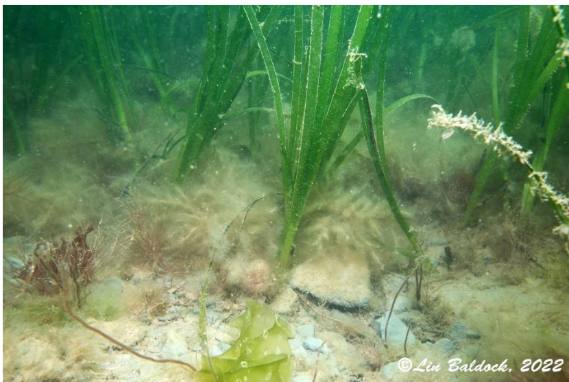
Zostera at Yarmouth – early season - with smothering layer of Ectocarpaceae