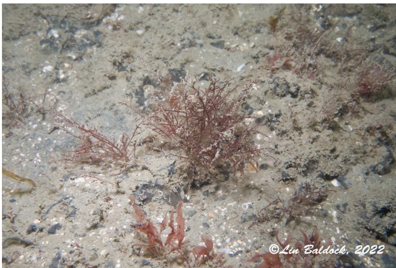
Sparse red seaweeds on Tennyson Down at 10m