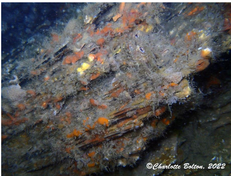
Stacked glass with faunal crust on Fenna wreck