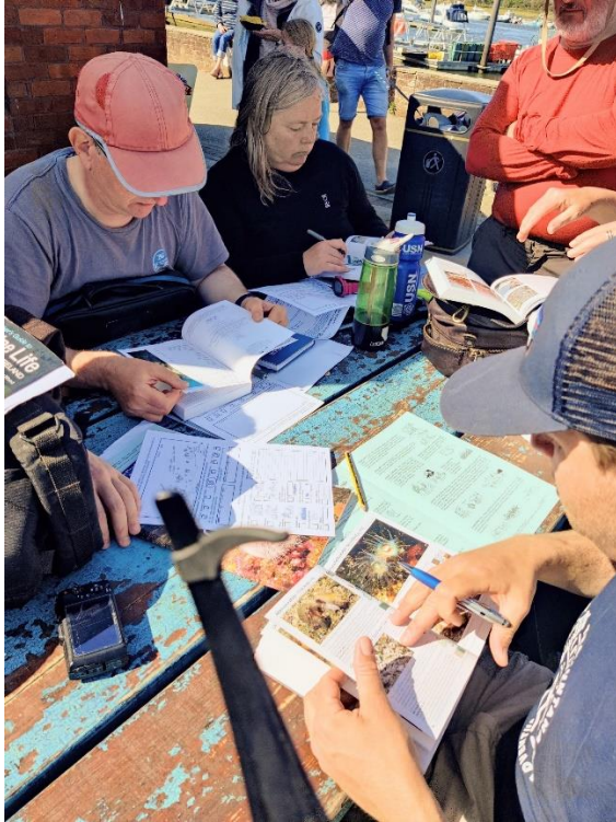
Volunteers post dive form completion and learning

For many dives it was possible to compare notes immediately afterwards, learning from experienced Seasearchers whilst memories were fresh. This proved to be a very popular addition to the activities. This idea will be extended next year with video conference briefings before dives.