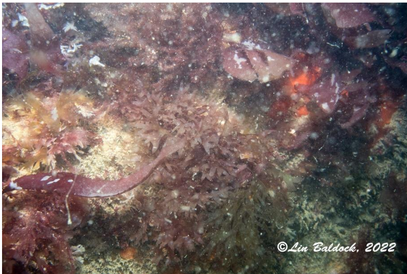
Mixed red seaweeds and short animal turf on vertical rock on Alum Bay at 5m

As expected this site had dense red algae on upward facing slopes and short animal turf on the verticals.