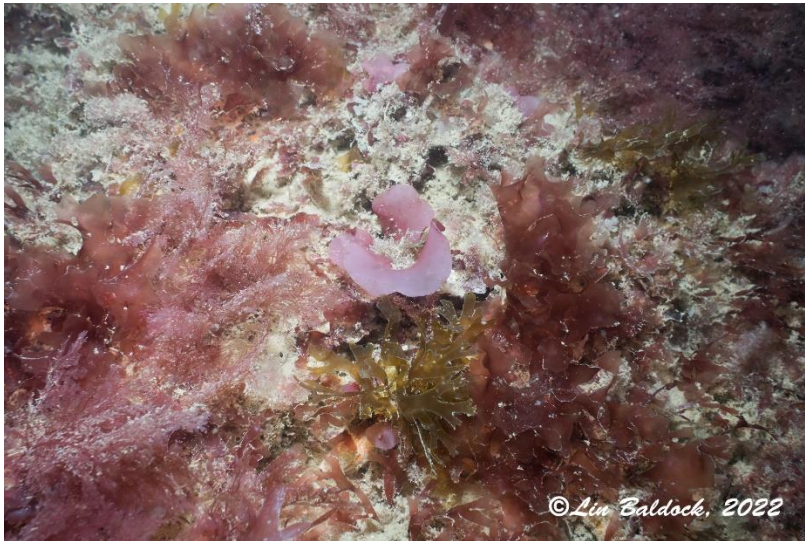
Red and brown seaweeds and Mermaid's Ear ( Meredithia microphylla ) on Tennyson Down at middle depth