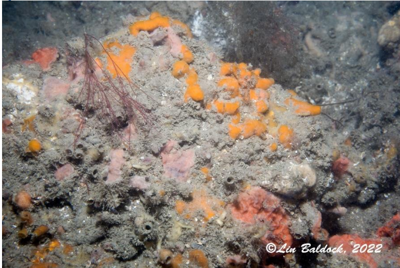
Sabellaria and sponge crust with drift algae on Tinker Rock