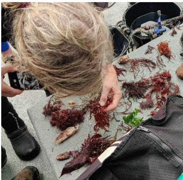
Volunteers examining seaweed samples during surface interval