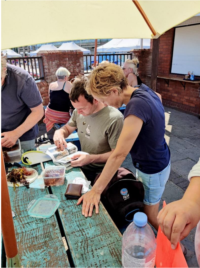
Volunteers learning from seaweed samples