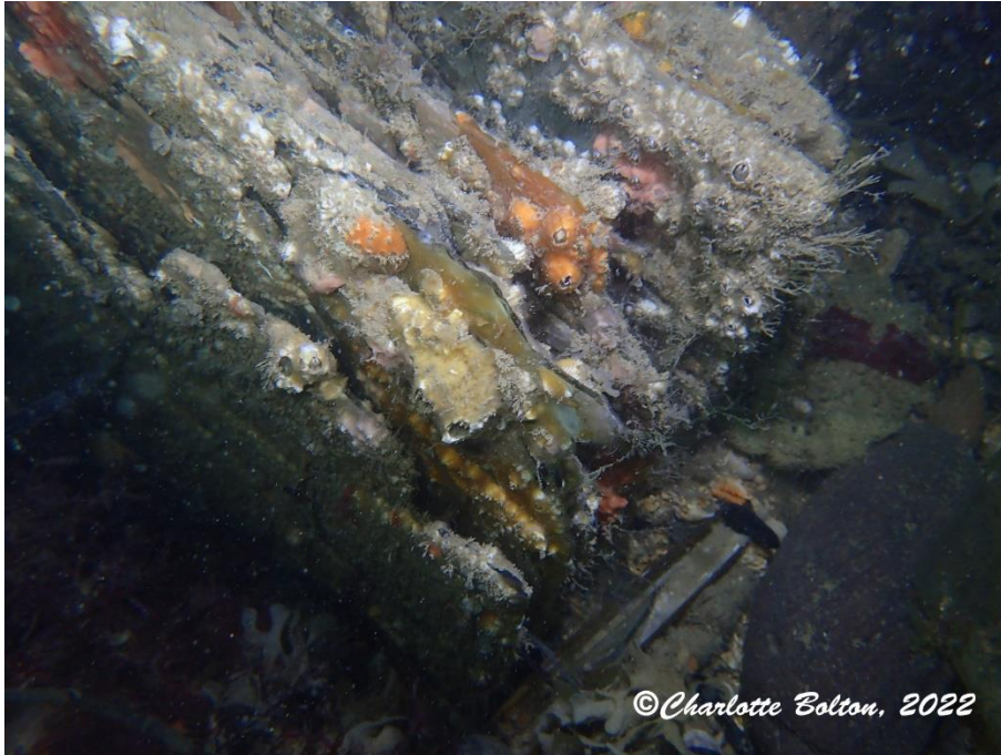
Stacked glass with sponge crust on Fenna wreck