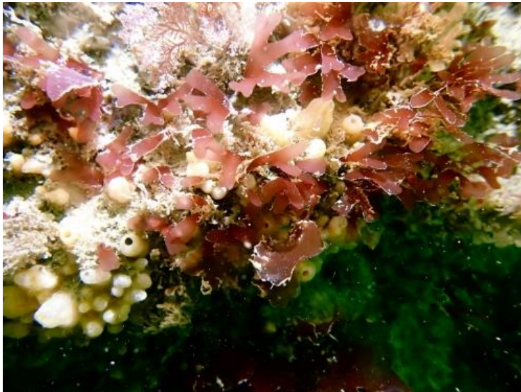
Mixed algae and sponge cushions on Tennyson Down

4. The data from all sites will be examined to give a measure of species diversity. Tennyson Down, for example, demonstrated a range of algae and fauna but was felt overall to have low diversity.