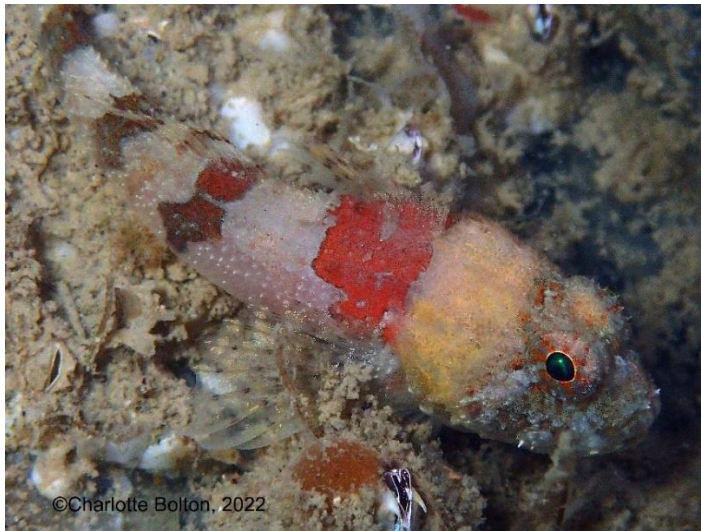
Norway Bullhead on Fenna

4. The data from all sites will be examined to give a measure of species diversity. Tennyson Down, for example, demonstrated a range of algae and fauna but was felt overall to have low diversity.