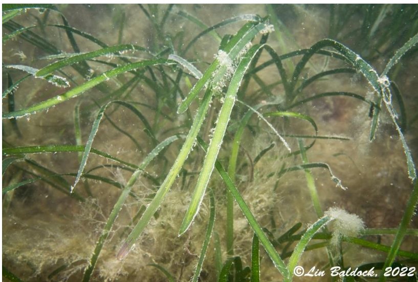
Zostera at Yarmouth, early season